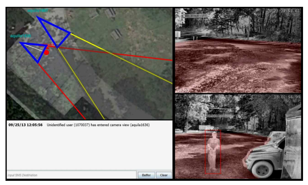
Persistent Vision geo fencing and infrared capabilities with software defined sub-zones

Persistent Vision does this through the creation of a registry of known personnel and a rules database that grants permissions by personnel type. It can be provisioned by building management for guests and technicians based on functional areas.